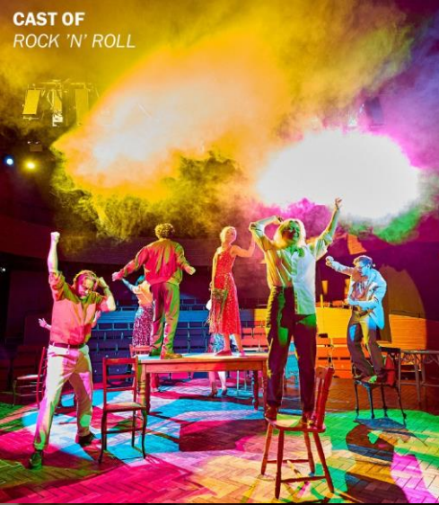
CAST OF ROCK 'N' ROLL EMILIA FOX & THEO JAMES SEX WITH STRANGERS